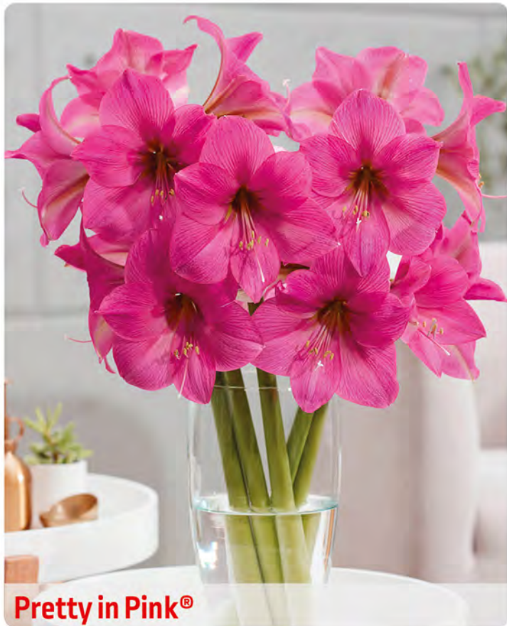
Pretty in Pink®